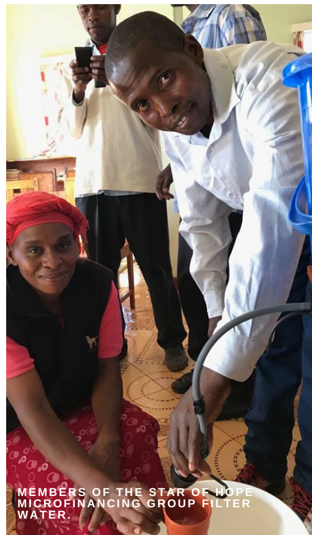
MEMBERS OF THE STAR OF HOPE MICROFINANCING GROUP FILTER WATER.