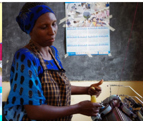
Members of the Maji ya Chai Uniform Project demonstrate the sewing machine and knitting machine.

The CPS Sisters operate the Upendo Leprosy Home in the village of Maji ya Chai in the outskirts of Arusha, Tanzania. When they originally took on this project, the local Lions Club promised to continue to donate funds to keep the home operating. Circumstances have changed, and the Lions are not able to