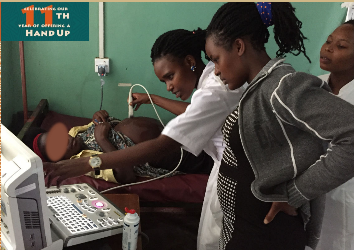
The midwives of St. Cecilia Clinic put their new training to work in performing an ultrasound analysis for a pregnant woman from the area.

CELEBRATING OUR 11 TH YEAR OF OFFERING A HAND UP