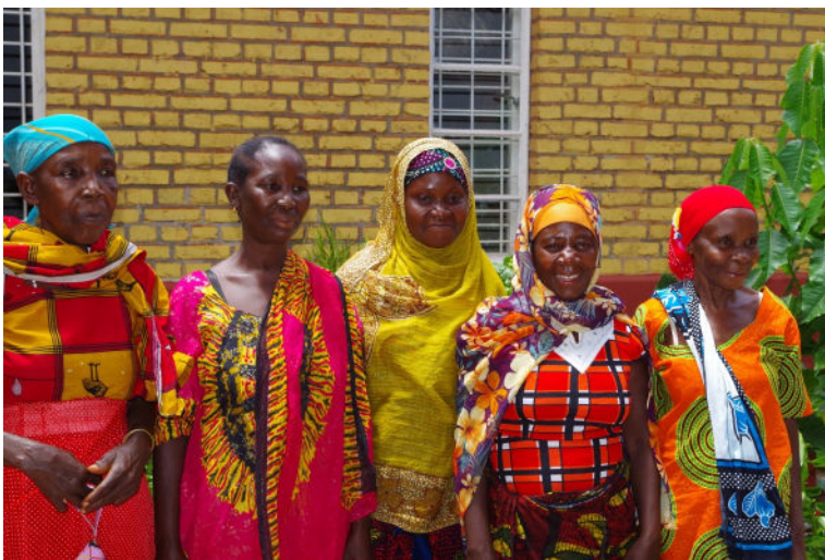
Members of the Mamas of Kibuchini provide a report to MPA at a meeting held in Morogoro, Tanzania.

Known as the “Mamas of Kibuchini,” this small group of rural women is similar to several small self-help groups being mentored by CPS Partners.